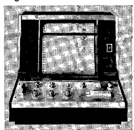
CHART DRIVE: twelve synchronous speeds-0.5, 1, 2, 4, 10, 20-by dial selection, inches per hour or per minute by panel switch. Rapid scanning in forward and reverse.