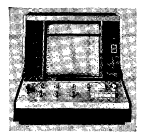
ELECTRICAL RANGE: twelve pre-calibrated ranges by switch selection—0.5, 1, 2, 5, 10, 20, 50, 100, 200, 500, 1000, 2000, 2000, Variable range expansion from 100% (off) to 40% of selected range.

Yes, our MR Recorder often seems like many instruments at work...and the specs tell you why.