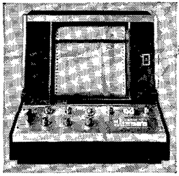
DESCRIPTION: SARGENT MODEL MR RECORDER—automatic, self-balancing, 10-inch potentiometer recorder. High gain amplifier; high stability solid state reference power supply needs no standardization. Line operated.