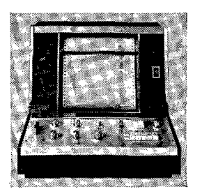
ELECTRICAL FILTERING: four position switch to reject transverse and common mode A.C. superimposed on the D.C. signal, without loss of sharp balancing characteristics.