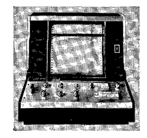
PEN SPEED: 1 second for full scale transverse. CHART TAKE-UP: automatic, by motor with preset torque-or by-pass for free end chart tear off.

This gives you some idea why the SARGENT MODEL MR can do the work of several less versatile recorders, manual potentiometers or precision meters. To get the complete picture, write for Bulletin MR.